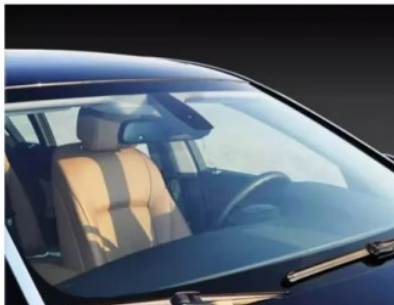
Suit for auto glass sealing and gap filling