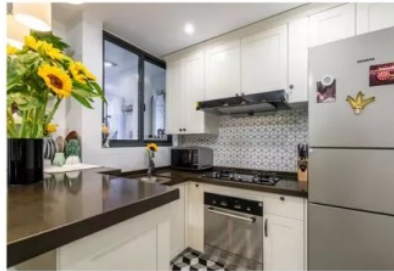
Suit for kitchen sealing and gap filling