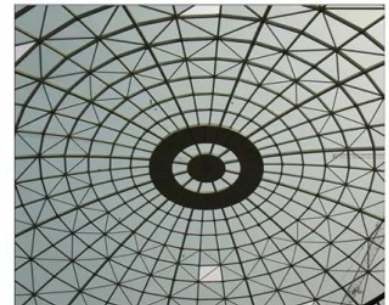
Suit for sunlight room sealing and gap filling